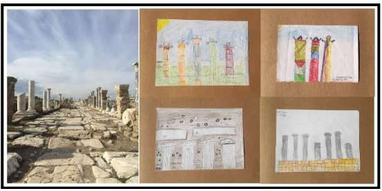
Figure 3. Laodikeia- Syrian Street and students' painting activities interaction (Özdemir, 2016)

The statements in the forms of M.C. : ".....we have seen many historical artifacts... M.Y. : "... there were historical artifacts..." and D.K. "....we have visited the historical works ..." that support the students' drawings are considered important in terms of selectivity in visual perception.