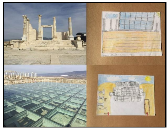
Figure 8. Laodikeia Temple A- viewing terrace and students' painting activities interaction (Özdemir, 2016)

(heads of sculptures, jewelry, ceramic pots, and legs) uncovered in studies were placed there. 14 columns were raised in the courtyard, and the third dimension was added with bedplate, column, header horizontal girder (architrave) and geison-aspect. This area was also made available for the use by visitors with a feature of being a viewing terrace with a spectacular landscape overlooking Pamukkale and the Lykos (Çürüksu) Plain (Şimşek, 2013). It is possible to observe the impressions made by immovable cultural assets such as Temple A Building and movable cultural assets in the visual perception and memory of students from their free painting activities (Figure 8).