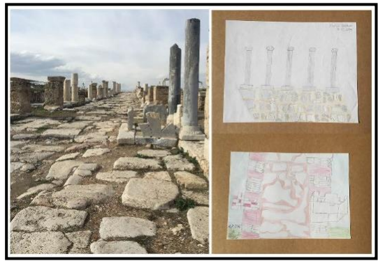
Figure 5. Syrian Street and students' painting activities interaction (Özdemir, 2016)

The bases of the north portico of the street are covered with rectangular marble plates. However, even though most of them were destroyed, some plates could remain in their place even if in parts (Şimşek, 2013). It is possible to observe the impressions made by the flooring of the Syrian Street in the visual perception and memory of students from their free painting activities (Figure 5).