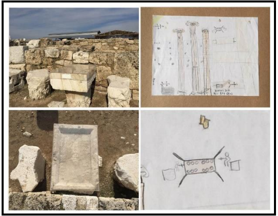
Figure 4. Syrian Street – game table and students' painting activities interaction (Özdemir, 2016)

In ancient ages, outer public spaces usually involved social activities (Francis, 1989). It is possible to see the spatial traces of social life in the ancient city. The porticos upgraded in one or two steps and the rows of shops behind them are located on both sides of the Syrian Street of Laodikeia ancient city. It is possible to observe the impressions made by the game table on which the people of that period could play when they came together in front of the shop for recreational and chatting purposes in the visual perception and memory of students from their free painting activities (Figure 4).