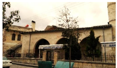
Image 3. Ahmet Celebi Manzume sketch (left) and facade character (middle and right)