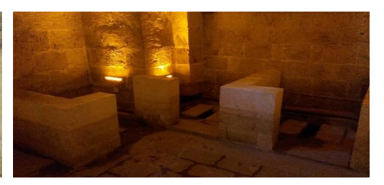
Image 2. Examples of stairs, pools, and toilets in Gaziantep Kastels

Kastel, a word thought to have passed from Arabic to Turkish, is defined as A place where water is divided into parts (Çam, 1982). The word Kastel continues to exist today as a nomenclature used for all fountains, large and small, in the city of Kilis, a neighbour of Gaziantep.