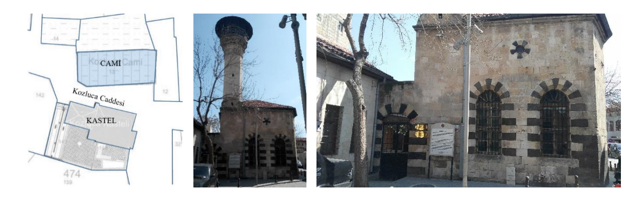
Image 12. Kozluca Manzume sketch (left) and mosque (middle and right)

Kozluca Manzume is in the neighbourhood of the same name, on Kozluca Street (Image 12). Manzume consists of a mosque and a kastel, which is said to have a masjid. The exact date of construction and the builder of the mosque are not known, and different opinions are put forward on this issue. The materials used in the construction of the mosque suggest that it was built in the 16th century. According to historical documents, the building was first built as Zaim Ahmet Masjid. The report dated Receb 29, 1108 indicates that the building was converted from a masjid to a mosque (Güzelbey, 1992). Based on this, the building can be dated to the years 1690-1698. However, Cam (2006) states that it was built as Zaim Ahmet Masjid before 1543, converted into a mosque in 1702, and renovated in 1908.