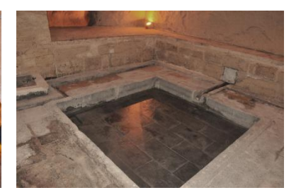
Image 8. Ihsanbey Kastel mosque (left) and pool (middle and right) sections

This section also has rock walls and cut stone walls. The last section is the volume on the left side of the Kastel hall, which is carved from the rock, has a cut stone ceiling and a black cut stone floor, with a ventilation gap closed at the ceiling. Five toilets that were used before are in this section.