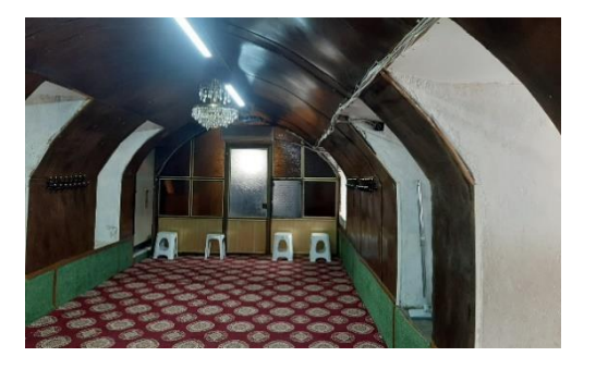
Image 11. Bekirbey Madrasah entrance facade (left) and interior view (right)