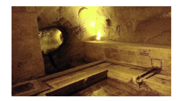
Image 7. Ihsanbey Kastel plan scheme (left), staircase section (middle), and interior character (right)

The third part is located to the right of the Kastel hall. This part, with walls and ceiling from rock, and floor from earth, has a square column of rock near the outer wall and a well in its corner. The prayer and the resting places are separated by a cut stone wall. Next to the stairs, between the second and the third parts, there is a small circular rock wall. The fourth part right across the stairs is the place of prayer called the masjid, which has a screed floor, a vaulted cut stone ceiling, and a mihrab (Image 8).