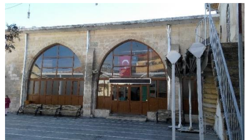
Image 9. Bekirbey Manzume sketch (left), mosque entrance (middle), and northern courtyard (right)